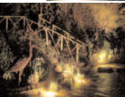
TOP The grotto with its little statue of the god Pan looks very dramatic - if a bit spooky - when lit up. RIGHT The sluice gates look spectacular when lit. ABOVE The outline of the heron can be seen from lights placed under the surface of the water. Artwork and trees are among the best things to illuminate in a garden.

B arry and I have been creating our garden in the Cotswolds for over 40 years, now. Our style developed as we matured and as we became more knowledgeable (ie, we made our mistakes look as though they were deliberate!) There was one last hurdle. What was the garden doing while we slept? How did it look to all those lucky little slugs and beetles munching away in the dark? Plainly, we needed to illuminate it.